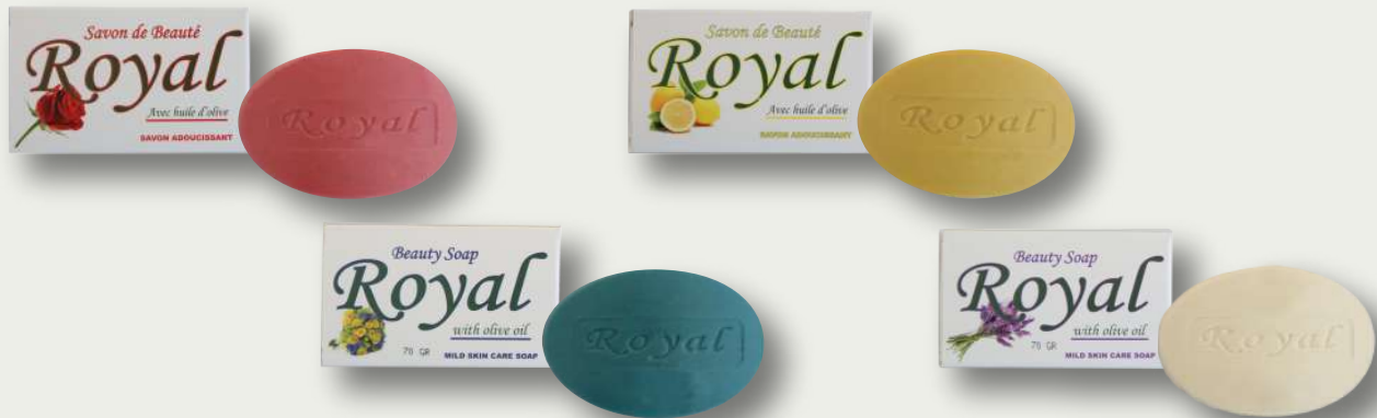
ROYAL BEAUTY SOAP CARTON BOX 1 PC NET WEIGHT WHEN PACKED: 70 GRS X 1 BAR = 70 GRS

Our 100% NATURAL BEAUTY SOAP, made with the tradition of the ancients and molded in modern shape, a hot process soap, rich with natural ingredients is gentle for the body skin and hands. It is composed of: Olive oil, beef tallow, Coconut oil, Palm oil, soya oil, sunflower oil, dye, fragrance, caustic soda, sea salt, water