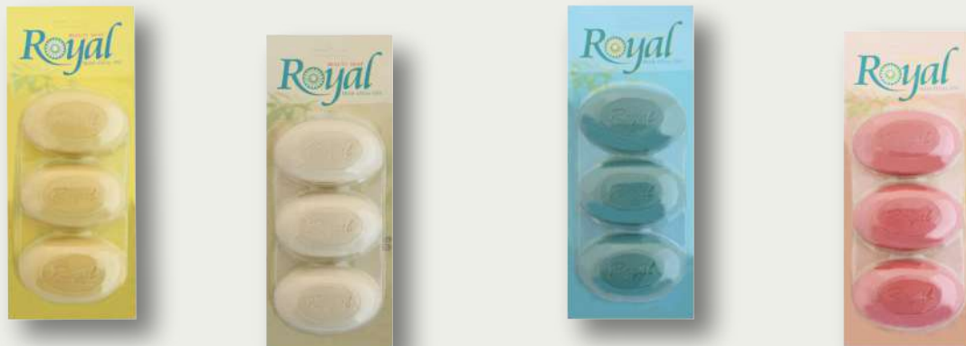
ROYAL BEAUTY SOAP CARTE BOX 3 PC NET WEIGHT WHEN PACKED: 120 GRS X 3 BARS = 360 GRS